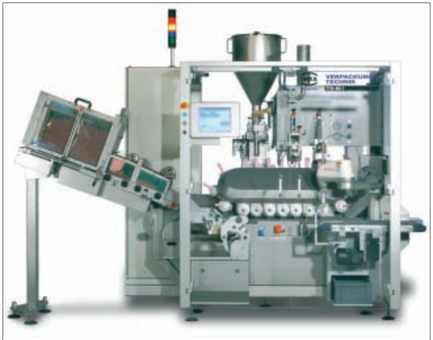
Diagonal loop: IWK's latest tube filler, the TFS 80-1, uses the company's established system

line in one go," says sales manager Barry Chadwick. "Otherwise the whole thing can be a nightmare. You have to integrate the controls and machine interfaces, and if one machine is delayed it can put the entire project out."