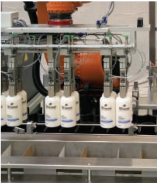
Top-load case-packer: Elematic 6000 EFC from Paal Packaging Machinery

them wrapping small jars, compacts, pencil and brush products in collations of twos and threes. The cantilevered Pewo-pack 250 Compacts have replaced older machines, and wrap the items in polyethylene film, says UK company Pester Pac Automation. They are capable of wrapping 60 collations a minute, but are currently running at lower speeds to allow for potential future increases in demand.