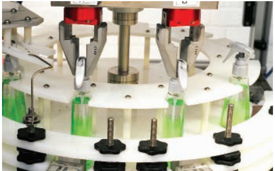
Starwheel capper: Cap Coder machine solves a contract packing problem for Cosmetica

An operator can run a single-head machine at speeds of 50-70 units a minute, says the company, when filling lotions and creams into jars and bottles. When filling smaller jars, dispensing speeds for creams can be up to 80 a minute.