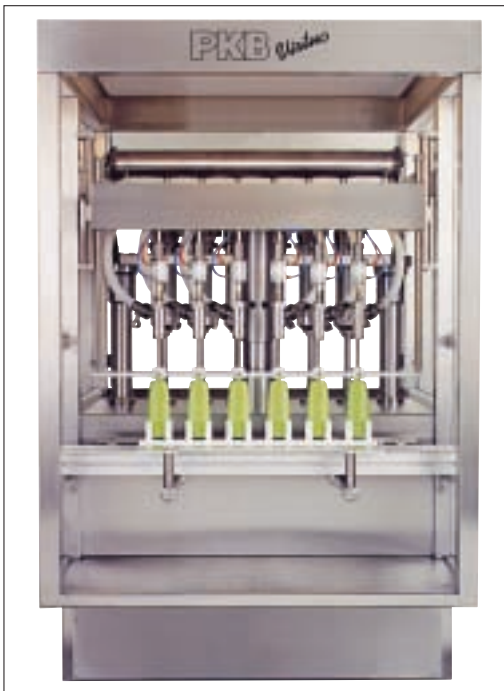
Servo driven: APKB Virtuo in-line liquid filler