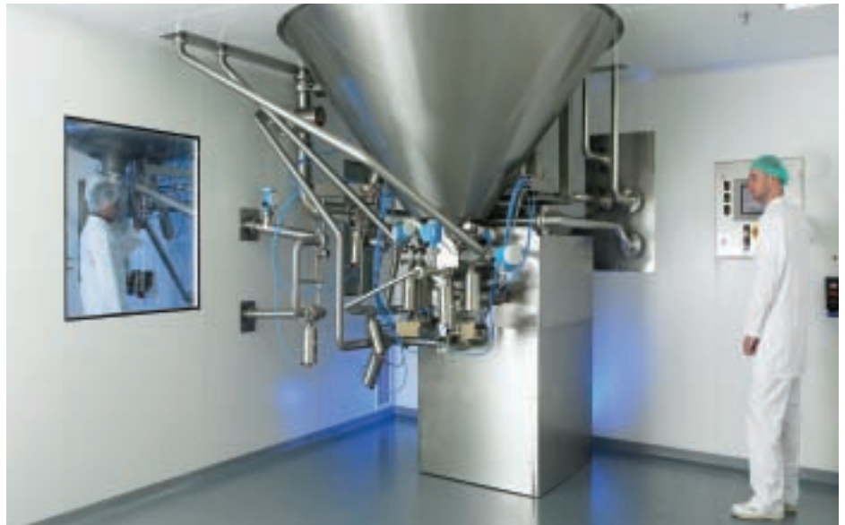
Vacuum processing: Lower floor section of the FrymaKoruma Dinex system at ASM, Switzerland

French supplier PKB has applied servo drive technology to the particular needs of the cosmetics and toiletries industries in the design of its Virtuo volumetric in-line filler. Along with the balcony-type construction, redesign of the filling and cleaning circuits now means that these products can be filled to the exacting